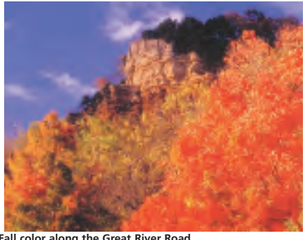
Fall color along the Great River Road.

For a scenic drive, follow Highway 14 west as it winds though the hills and valleys of the "Coulee Country" to La Crosse. Begin your day with a River Town Discovery Tour. Sit back and relax as your tour guide details the homes of lumber barons, early entrepreneurs and more. Stop atop Granddad Bluff to enjoy a scenic