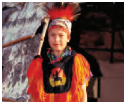
Native American dancer, Lac du Flambeau.

State Forest. It is a water paradise of boating, fishing, swimming and watersports. Indeed, Minocqua is known as "the island city" – virtually surrounded by water. For an overview of the wildlife and striking local habitat, visitors can cruise through the spectacular Willow Flowage aboard the 65-passenger motor launches of Wilderness Cruises. Off the water, there's an impressive network of trails for hiking, biking, cross-country skiing, snowshoeing and snowmobiling.