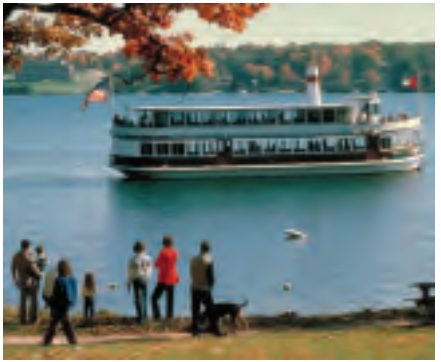
Lake cruise, Lake Geneva.

CONTACT: E-mail: info@gochicago.com www.gochicago.com