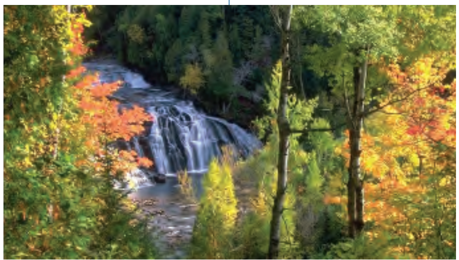
Potato River Falls, Iron County

Destinations Visited: Chicago, IL; Lake Geneva, WI; Madison, WI; Spring Green, WI; La Crosse, WI; Eau Claire, WI; Hayward; Bayfield/Apostle Islands, WI; Lac du Flambeau, WI; Door County, WI; Sheboygan, WI; Milwaukee, WI; and back to Chicago, IL.