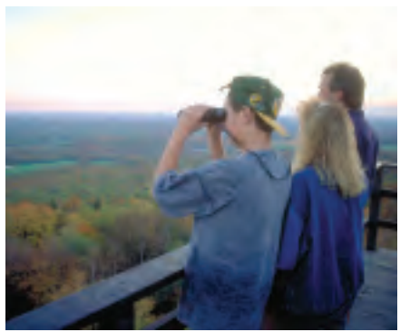
Rib Mountain State Park, Wausau.

Wausau's, Grand Theater is a jewel of a performing arts center. Originally constructed in 1927, it highlights a ten-square-block downtown historic district. Nearby, the Marathon County Historical Museum displays local history in the elegant Victorian home of former lumber baron Cyrus Yawkey. The city's Leigh Yawkey Woodson Art Museum has garnered a national reputation for its remarkable collection of avian art. Outside of town, Rib Mountain towers 700 feet above the city. The mountain is home to Granite Peak