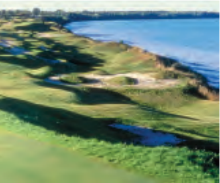
Whistling Straits, Kohler,

CONTACT: Sheboygan County Convention and Visitors Bureau 712 Riverfront Drive, Suite 101 Sheboygan, WI 53081-4665 00+1-920-457-9491 info@sheboygan.org www.sheboygan.org