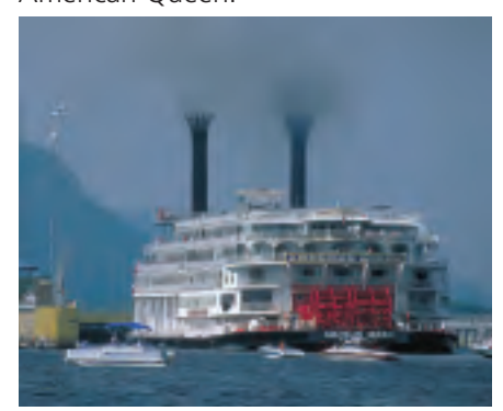
Mississippi riverboat, La Crosse.

No visit to La Crosse is complete without a luncheon cruise on the Mississippi River aboard one of three excursion boats; the Julia Belle Swain, La Crosse Queen and the Island Girl all serve sumptuous meals. After lunch, tour the exquisite Chapels of St. Rose. Grab an afternoon snack on a tour of Pleasoning Gourmet Seasoning, or taste the beer-making prowess of the City Brewing Company. Evening plans can include dinner at one of our award-winning restaurants with Broadway-style entertainment, or experience the life of early Norwegian immigrants with an Evening at Norskedalen. Shopping for cheese, local products, antiques or souvenirs is easy with just one stop in Historic Downtown La Crosse or Old Towne North. With a little luck you may see one of the Mississippi riverboats like the American Queen.