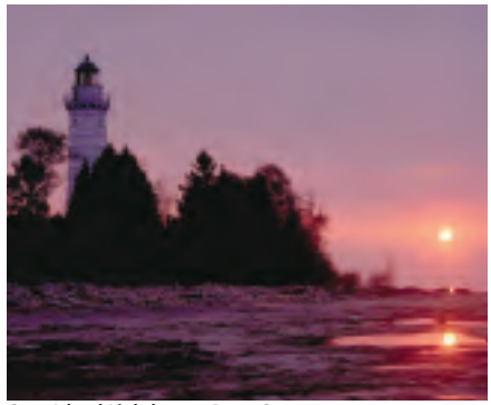
Cana Island Lighthouse, Door County.

In Sturgeon Bay, make a little time for the Door County Maritime Museum. You can also tour two of the county's 10 lighthouses - the Cana Island Lighthouse in Baileys Harbor and the Eagle Bluff