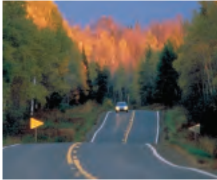
Fall color near Hayward.

Depart Eau Claire north on Highway 53, the gateway to Wisconsin's western Great North Woods and the Hayward Lakes area. Hayward, a former lumbering town along Highway 63, keeps its past alive with the Lumberjack World Championships