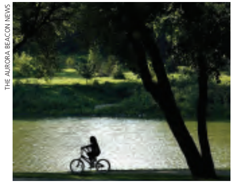
Biking along the Fox River.

South suburban golf courses have played host to the U.S. Open and the Advil Western Open. Some of the challenging courses are open to the public: Balmoral Woods Country Club, Silver Lake Country Club, and Cog Hill Golf & Country Club.