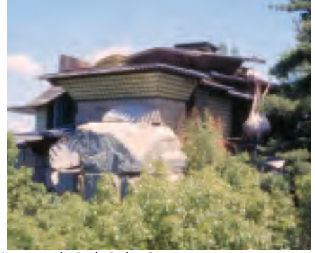
House on the Rock, Spring Green.

From Madison, take a scenic drive west on Highway 14 through the southern Wisconsin River Valley to Spring Green. Here you can tour one of Wisconsin's top attractions, the