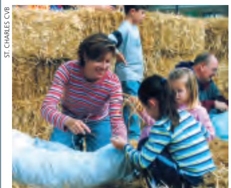
St. Charles Scarecrow Festival, St. Charles.

Enjoy lunch or dinner at Walter Payton's Roundhouse featuring a microbrewery, live entertainment and a museum tribute to the great football legend himself. Then head to the Schingoethe Center for Native