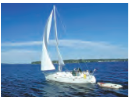
Sailing the Apostle Islands, Bayfield.

If lighthouse tours and blue-water sailing are your cup of tea, the Apostle Islands will delight you. Explore many recreational opportunities including boat excursions, hiking, sea kayaking, and cycling. Bayfield's hillside orchards and fruit farms are open for picking or buying garden-fresh produce. Their many art galleries, studios, and boutiques are a welcome indoor adventure.