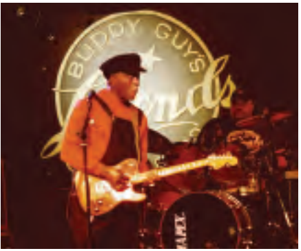
Buddy Guy's Legends Blues Club, Chicago.

You could spend the whole day in one of Chicago's renowned museums: The Field Museum, the city's