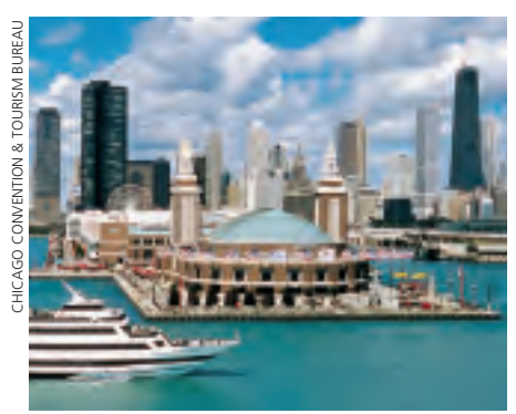
Navy Pier, Chicago.

If the weather's nice enjoy the day outside at the Lincoln Park Zoo, famous for its historical structures and state-of-the-art animal facilities. Navy Pier offers visitors over 50 acres of parks, a 150-foot Ferris Wheel,