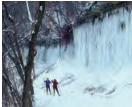
Cross-country skiing on the Chippewa River State Trail.

Enjoy a few of the state's finest bicycle trails - the Red Cedar State Trail, Chippewa River State Trail, and Old Abe State Trail. Cross-country skiing and snowmobiling in winter make the Chippewa Valley a true