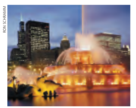
Buckingham Fountain, Chicago.