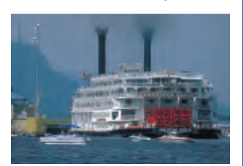
American Queen Riverboat on the Mississippi River, La Crosse.

From Eau Claire, continue south on Highway 93 to La Crosse. Begin your day with a River Town Discovery Tour. Sit back and relax as your tour guide details the homes of lumber barons, early entrepreneurs and more. Stop atop Granddad Bluff to enjoy a scenic vista overlooking three states -Wisconsin, Minnesota and Iowa. Enjoy a guided tour of the Hixon House, the Victorian home of lumber Baron Gideon Hixon. No visit to La Crosse is complete without a luncheon cruise on the Mississippi River aboard one of three excursion boats; the Julia Belle Swain, La Crosse Queen and the Island Girl serve sumptuous meals. With any luck you may see one of the Mississippi riverboats like the American Queen.