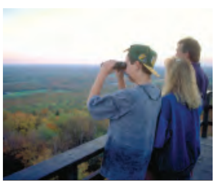
Rib Mountain State Park, Wausau.

Wausau is also the center for buying and selling ginseng. In fact, Marathon County produces 95% of the nation's crop of this medicinal root so valued in Asia. To learn more, you can visit Hsu's Ginseng Enterprises where you'll find a gift shop loaded with ginseng-related products. You could also take a tour of Wisconsin's largest dairy. The Van Der Geest Dairy is a state-of-the-art