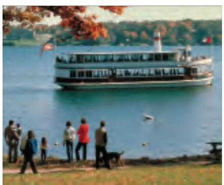
Lady of the Lake, Lake Geneva.

Lake Geneva Area Cconvention and Visitors Bureau 201 Wrigley Drive Lake Geneva, WI 53147 00+1-262-248-4416 staff@lakegenevawi.com www.lakegenevawi.com