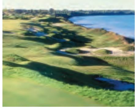
Whistling Straits, Kohler.

Sheboygan County Convention and Visitors Bureau 712 Riverfront Drive, Suite 101 Sheboygan, WI 53081-4665 00+1-920-457-9495 info@sheboygan.org www.sheboygan.org