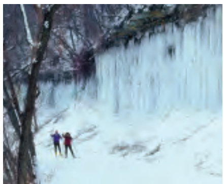
Red Cedar State Trail.

Depart Bayfield driving 3 hours south on Highways 63 and 53 into the beautiful Chippewa Valley to complete the Northwoods segment of the journey. If Minneapolis is your international point of entry, you can begin your Circle Wisconsin tour in the Chippewa Valley, anchored by the city of Eau Claire. The Chippewa Valley, gateway to both the great Northwoods and the Mississippi River. is located in the rolling hills and scenic river valleys of West-Central Wisconsin. The area is a perfect combination of woods and water with plenty of historic charm, unique attractions, top-notch entertainment and fine cuisine. Enjoy a few of the state's finest bicycle and cross-country ski trails – the Red Cedar State Trail , Chippewa River State Trail, and Old Abe State Trail. Don't forget to stop at the historic Leinenkugel's Brewery for your free tour and some shopping at the Leinie Lodge. For good food and an evening of professional entertainment, enjoy the Fanny Hill Inn and Dinner Theatre. Crosscountry skiing and snowmobiling in winter make the Chippewa Valley a true year-round destination. From the Chippewa Valley, you can head north toward Lake Superior or venture south toward La Crosse and the bluffs along the Mississippi River.