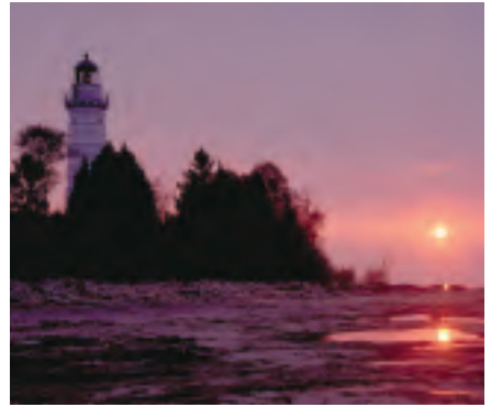
Cana Island Lighthouse, Door County.

time for an informative tour of the area's maritime history at the Door County Maritime Museum. You can also tour two of the county's 10 lighthouses – the Cana Island Lighthouse in Baileys Harbor and the Eagle Bluff Lighthouse in Peninsula State Park. A scenic drive along the bayside shoreline might end with a Door County Fish Boil – a tasty ensemble of whitefish, potatoes and onions. Evening entertainment under the stars might include original musicals at American Folklore Theatre, professional summer stock at Peninsula Players or memorable performances by the troupe of Door Shakespeare. Overnight at one of our many pampering resorts or B&B's. After breakfast, enjoy a short ferry ride to Washington Island where you can tour a Norwegian Stavkirke chapel, Sievers School of Fiber Arts, an ostrich farm and more. At noon, ferry back to the Peninsula, lunch, and then back down the Lake Michigan side. Stop at The Ridges Sanctuary for a guided nature walk or explore the sea caves of Cave Point County Park before heading out to the Great Northwoods and Lake Superior.